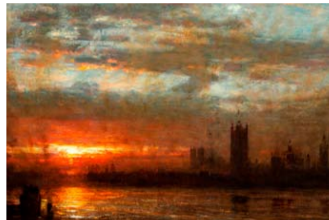
Westminster Sunset by Sir Albert Goodwin (1845-1932)

Beverley's delightful Edwardian Art Gallery is home to the 'Champney' collection featuring works by leading British artists practising in the Pre-Raphaelite mode including Arthur Hughes, Helen Allingham, Albert Goodwin and Sir William Russell Flint.